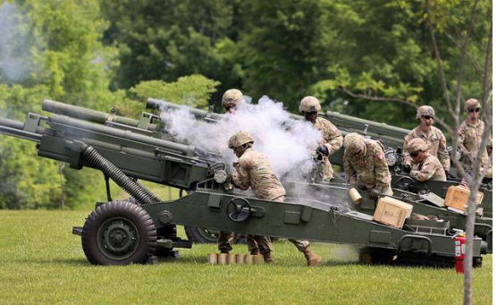
(Pics are from all KDVA's Cemeteries)